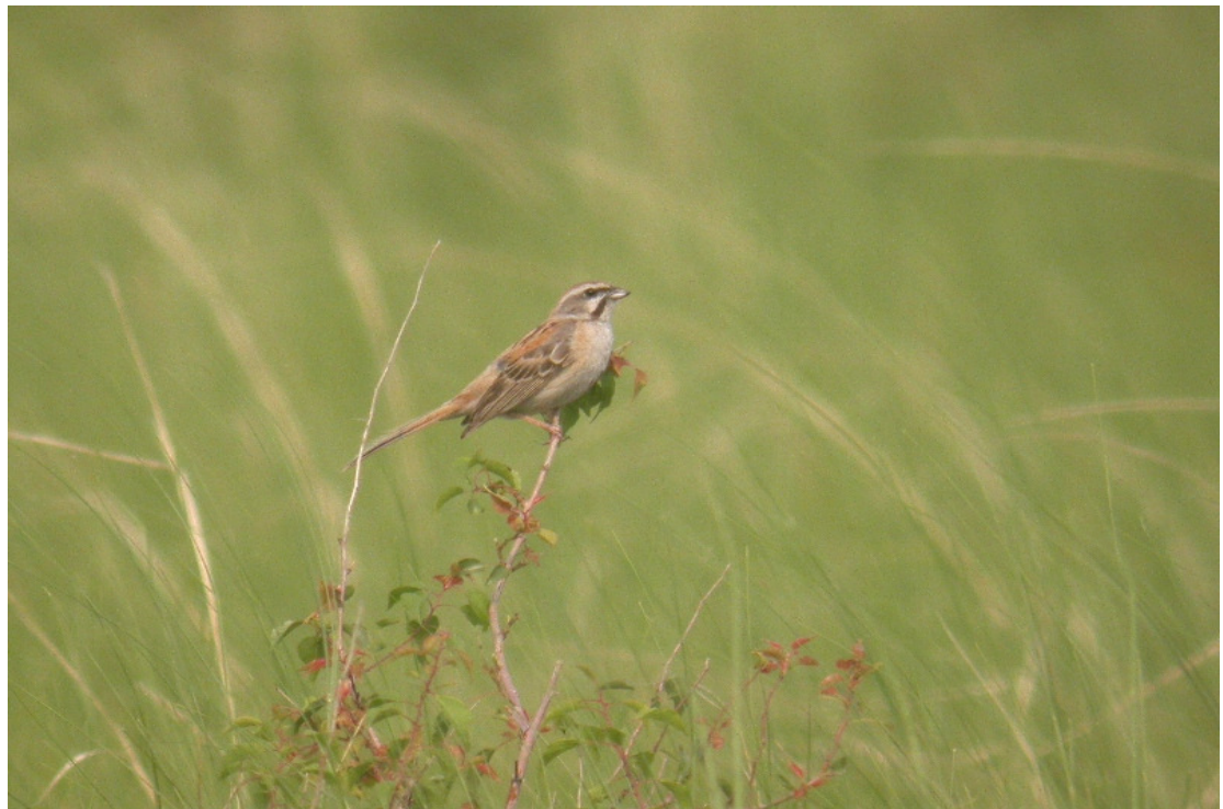
Rufous-backed Bunting Emberiza jankowskii in the grasslands at Beidagang (CN038); recent changes in this habitat type might account for the sharp decline in the numbers of this globally vulnerable species.