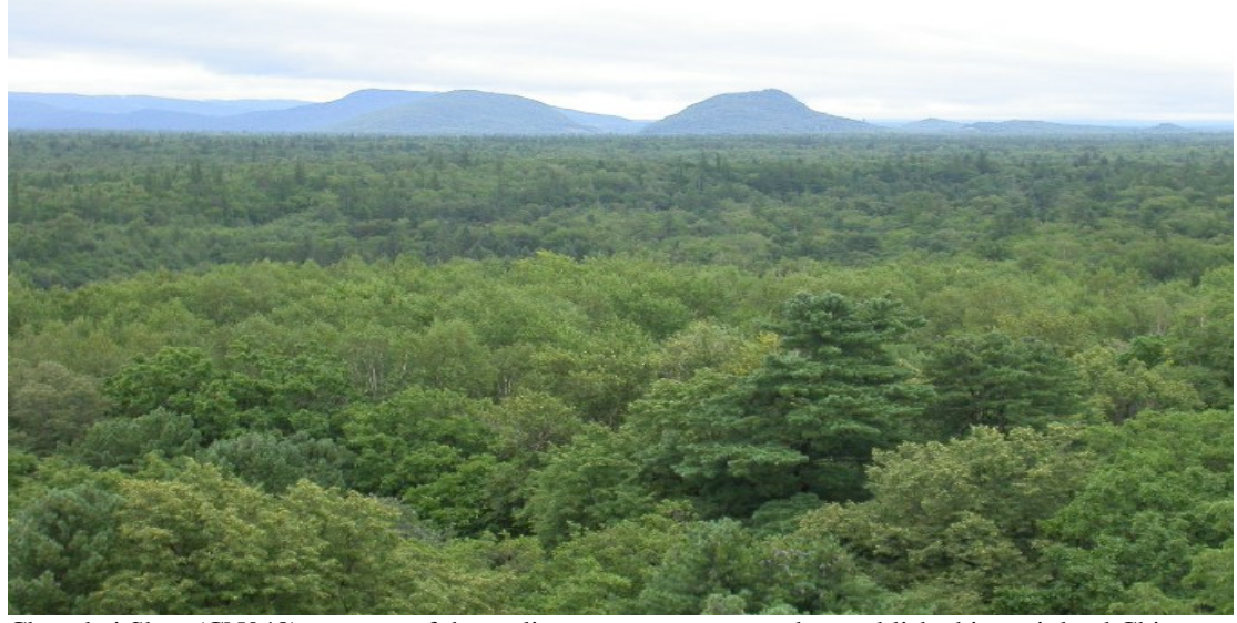
Changbai Shan (CN048) was one of the earliest nature reserves to be established in mainland China, to preserve the typical forest landscape of north-eastern China.

IMPORTANCE TO OTHER FAUNA AND FLORA: No information.